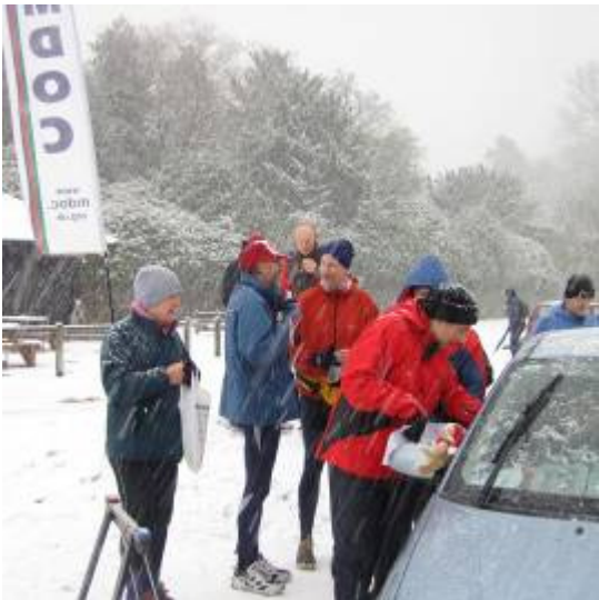
Registration at Lyme Park