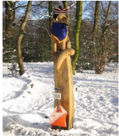
..... and a fox trying to keep warm