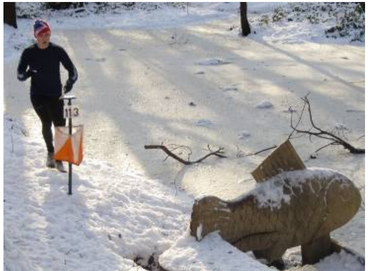
and Tom Fellbaum at a control by a fish sculpture