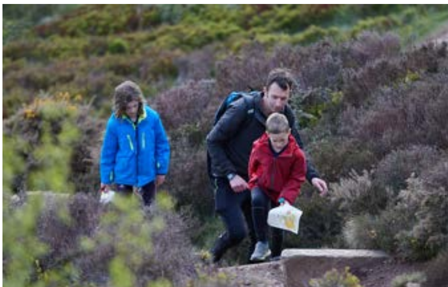
The Gray family tackle the Yellow