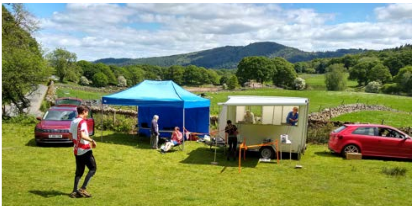
Download in the sun at the Northern Championships