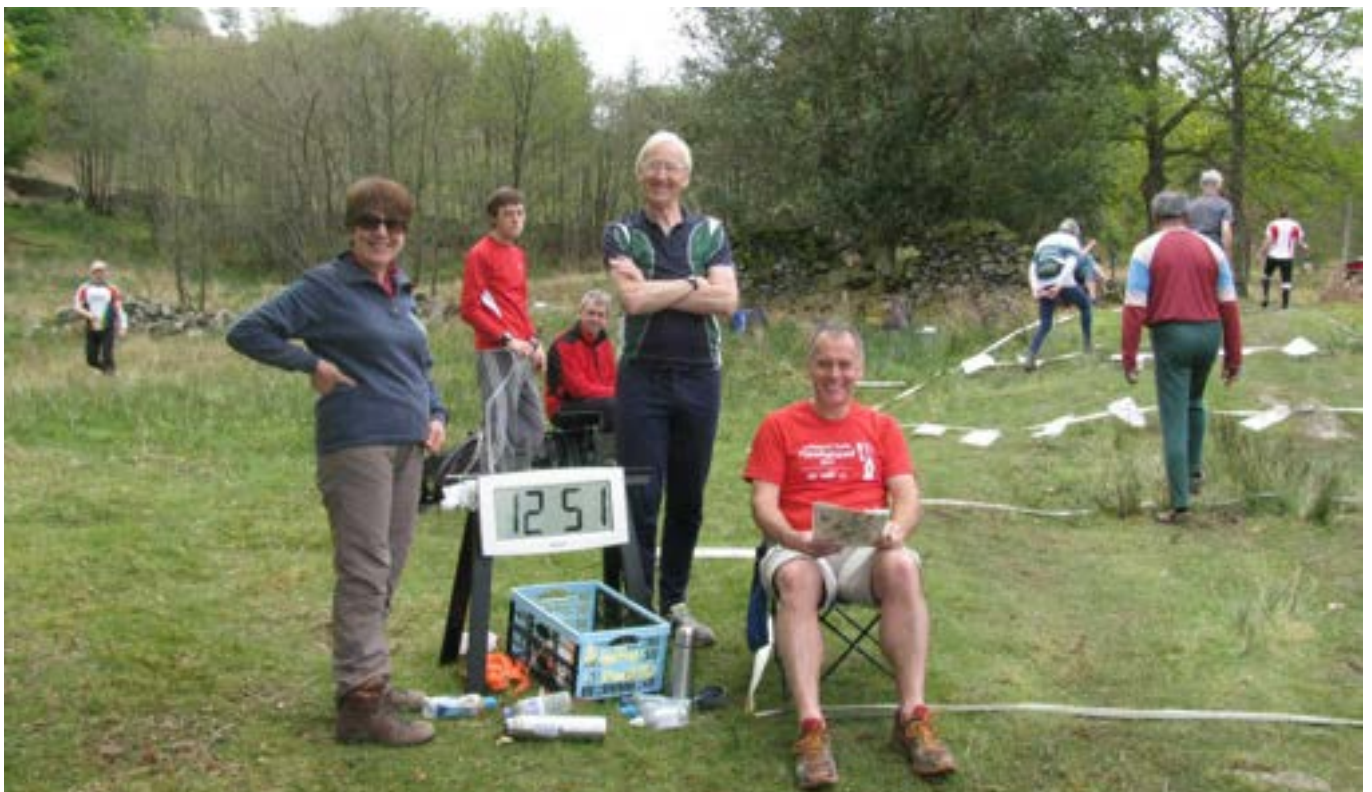
Happy volunteers in May 2012

'I particularly like volunteering to help run starts at orienteering events. It's an important part of an event, making sure people are on time and creating a calm atmosphere for competitors. It's a great opportunity to see lots of people and I take pride when things run smoothly! It's exciting to see competitors diving off into the terrain and I've had the joy of being in some beautiful woodlands in the past year.'