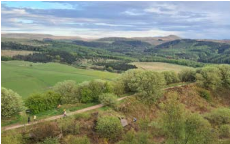
Macclesfield Forest behind the ridge