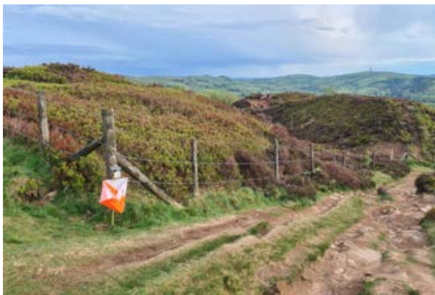
Fence corner