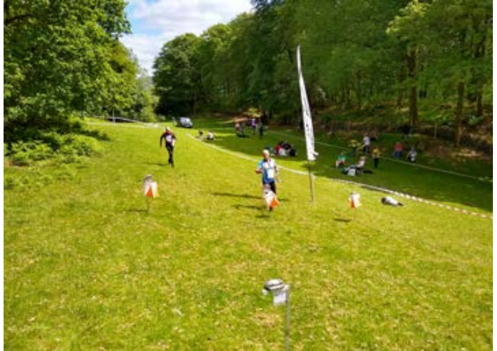
The run-in at the end of the Northern Champs