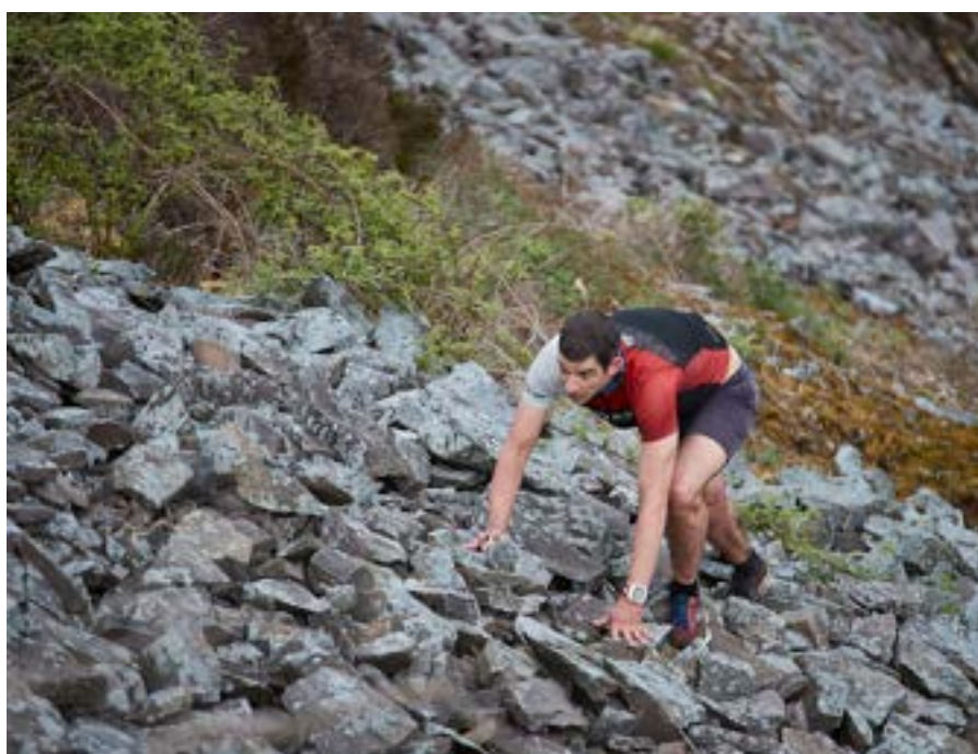
A competitor tackles the steep slopes